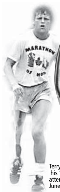
Terry Fox during his 1980 cross-country attempt. He died in June 1981 aged 21.

Fox commemorative coin is a first for Canada—it shows the likeness of a person other than a monarch