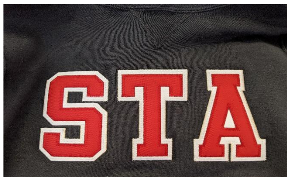
LOGO STYLE #2