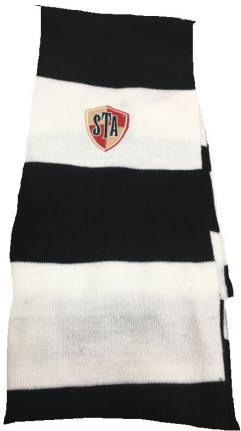
19 - STA Scarf $20 Each