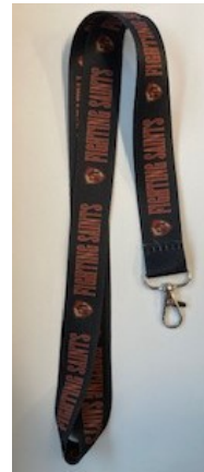
24 - Fighting Saints Lanyard $5 Each