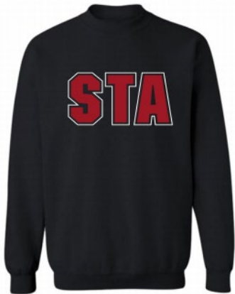
7 - Crew Neck, Twill Letters $49 Each