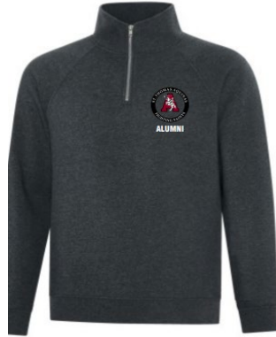
15 - ¼ Zip $56 Each