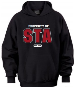
1 - Property of STA $41 Each