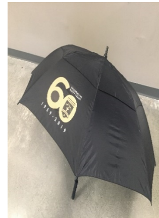
25 - Golf Umbrella (60 th Anniversary or Fighting Saints) $20 Each