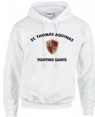
3- STA Fighting Saints $41 Each