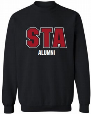
14 - Crew Neck, Twill Letters $49 Each