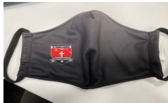
21 - STA Face Mask (Black or Ombre) $12 Each