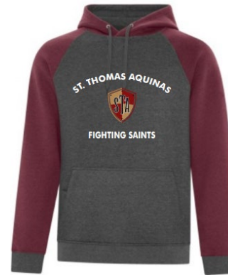
4 - Two Tone Hoodie $47 Each