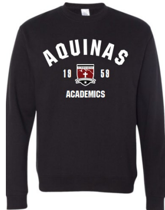
11 - Aquinas Academics $40 Each (Also available: 12 - Campus Ministry)