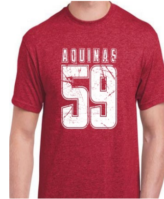
17 - S/S T-shirt $18 Each