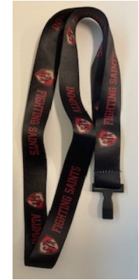
18 - Alumni Lanyard $5 Each