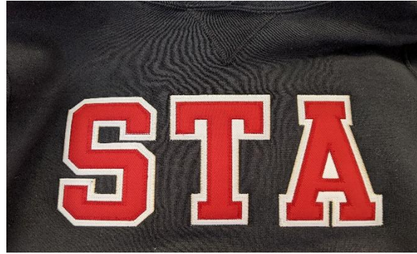
LOGO STYLE #2