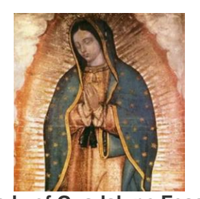
Our Lady of Guadalupe Feast Day

Take a few moments at the beginning of the day to refocus on God and find strength in His peace. Each morning will have a different style of worship music, the daily Gospel, and time to offer intentions.