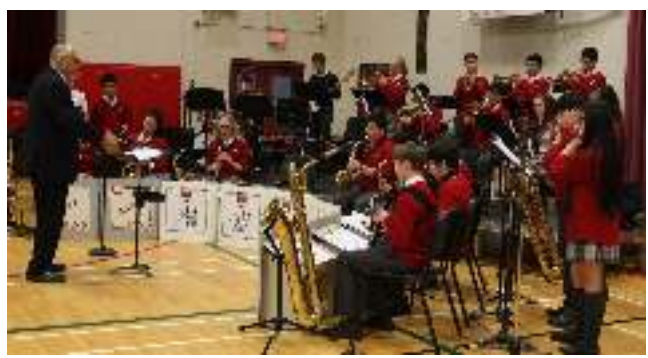
Junior Jazz Band