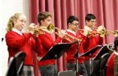
Grade 10 Concert Band