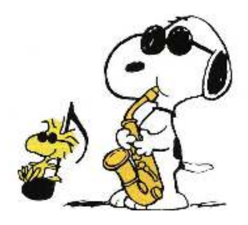
Senior Jazz Band