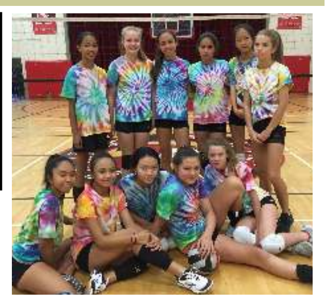
Bantam girls volleyball team held a tie dye bonding party to prepare their shirts for the Walk-a-thon. You can see the fabulous result!

he STA Juvenile girls Volleyball team are setting, bumping and spiking their way to the top! Our serving still needs a bit of work, but Rome wasn't built in a day, so I'm sure we'll come out Serv-ivors!