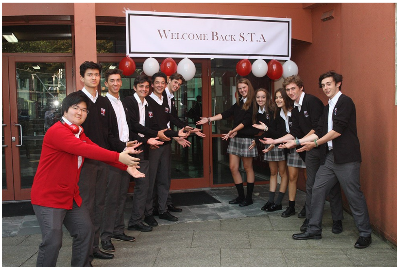
Student council members welcome students back to school on Tuesday, September 3. Last time through the old front doors. The old building is now being used for other purposes and is no longer accessible to students.