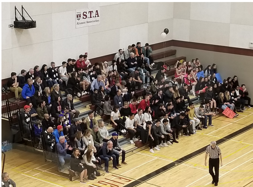
STA Alumni night on Thursday, January 30 where fans watched the senior boys basketball game. Check out the score on page 10.